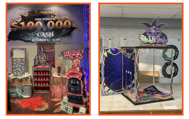
Examples of custom games we've made and promotional displays.

-We exceed in custom promotional items, and custom games. If you have something in mind, please give us a call with what you're thinking of and one of our experts can help you create something you, your customers and your team will love!