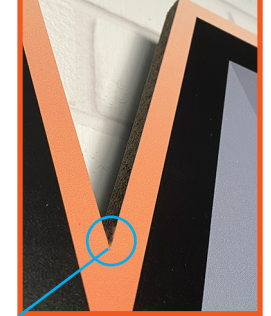
Thicker material tight spaces end up being more rounded due to bit size.

Thinner material we can use a smaller router bit to achieve more detailed cuts.